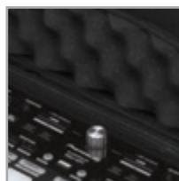
Fits Pioneer DDJ-XP1