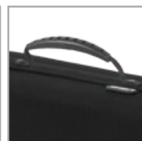
Heavy duty handle