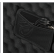
Mesh compartment for power adapter, extra cables