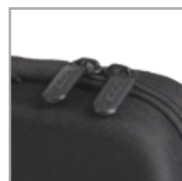
Easy grip zipper pulls