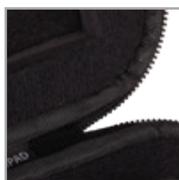
Durashock molded EVA foam