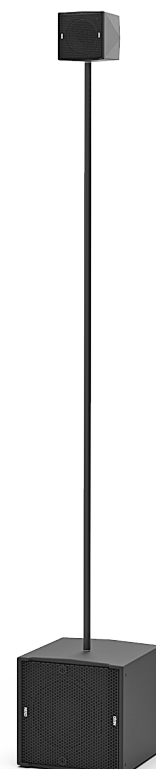
IDS108 deployed with ID14 and thin pole accessory.

The IDS108 shares the same phase response as other NEXO speakers, making it extremely easy to mix with other NEXO systems, e.g with the larger MSUB18 or with other NEXO subs, without risk of comb filtering or requiring complex electronic adjustment.