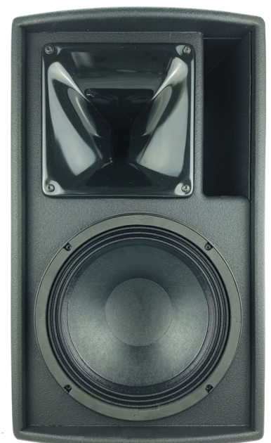
Grille removed, the large PS horn used with the HF driver

ePS10 acoustic phase response is NEXO phase signature allowing inter-operability between all NEXO speakers at all crossover points, except for the monitor setups where latency is minimized.