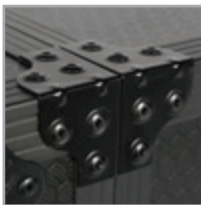
Extra-wide black solid aluminum profiles