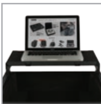
An extra notebook shelf included for your notebook