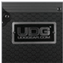
High grade aluminium UDG logo plate