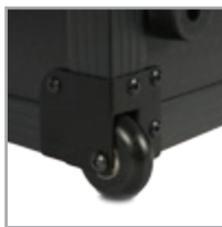
Built-in corner wheels on one side for convenient transport

We, at UDG have further fine-tuned already a great design concept of our flight case into one specially for the most discerning DJ/producer. Constructed from solid 9mm thick plywood, the outside is laminated in a black finished honeycomb/hexagonal "Stage Grip" pattern. The inner sides are protected with high density diamond embossed EVA foam protective padding. This is extremely robust padding protects the equipment against scratches, dust or other damages, creating a unique stylish & practical finish.