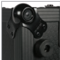
Industrial strength rubber feet at the bottom