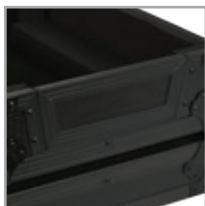
Removable case lid