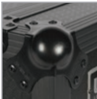
Heavy and powerful Steel Ball corners