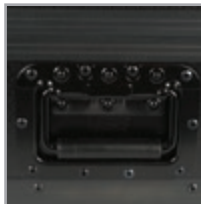
UDG spring-loaded handles