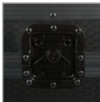
Recessed Butterfly Twist latch lock